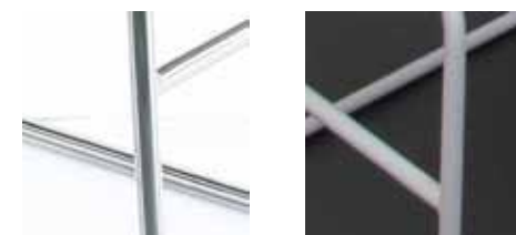
Chromed mild steel base as standard.