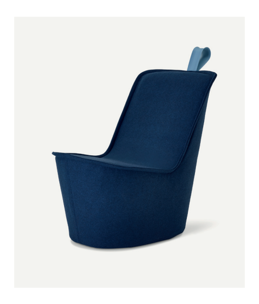
Pippin Chair with Strap Handle.