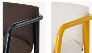
Black/white steel frame Standard