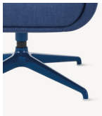
NaughtOne RAL powder coated 4 star base**

*Chrome available in North America only **With return to centre mechanism