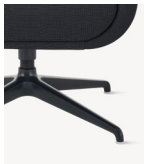
Black / white / polished 4 star base**