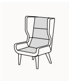
Two tone outer / inner

Hush Chair Sled Base BS EN 16139:2013, Level 2 Static load 200 kg