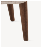
Solid walnut legs