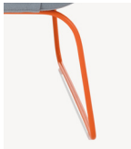
NaughtOne RAL powder coated sled base