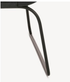
Black / white / chrome* sled base

Hush Chair Wooden Legs w720 d815 h1160 seat 430 (mm) weight 24.6 kg w28.5 d32 h45.5 seat 17 (in) weight 54.2 lb