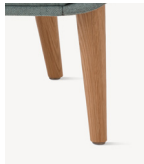
Solid oak legs