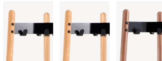
Black/white powder coated steel frame Standard