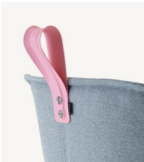
Light Pink RAL 3015