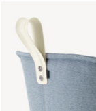
Oyster RAL 1013