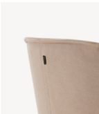
Without strap handle

ENTIRE COLLECTION ANSI/BIFMA X5.4 (2020) Lounge and Public Seating