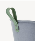
Pale Green RAL 6021