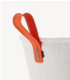
Traffic Orange RAL 2009