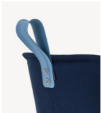
Pastel Blue RAL 5024