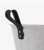
Black Grey RAL 7021

Pippin Chair with Castors and Strap Handle w530 d760 h760 seat 390 (mm) weight 22 kg w21 d30 h30 seat 15.5 (in) weight 48.5 lb